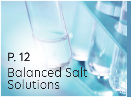
P. 12 Balanced Salt Solutions