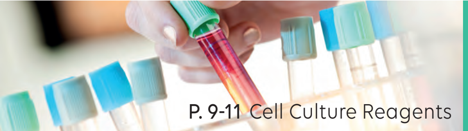
P. 9-11 Cell Culture Reagents

P. 14 Order | P. 15 Payment terms | P. 15 Product warranty