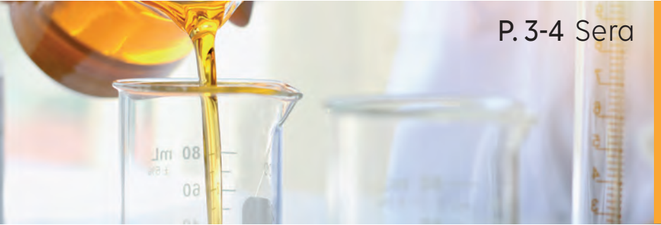
P. 3-4 Sera