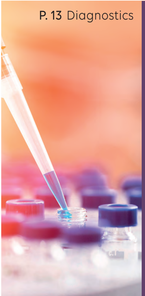
P. 13 Diagnostics