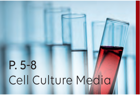
P. 5-8 Cell Culture Media